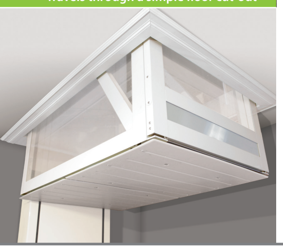
Authorized Savaria dealer: