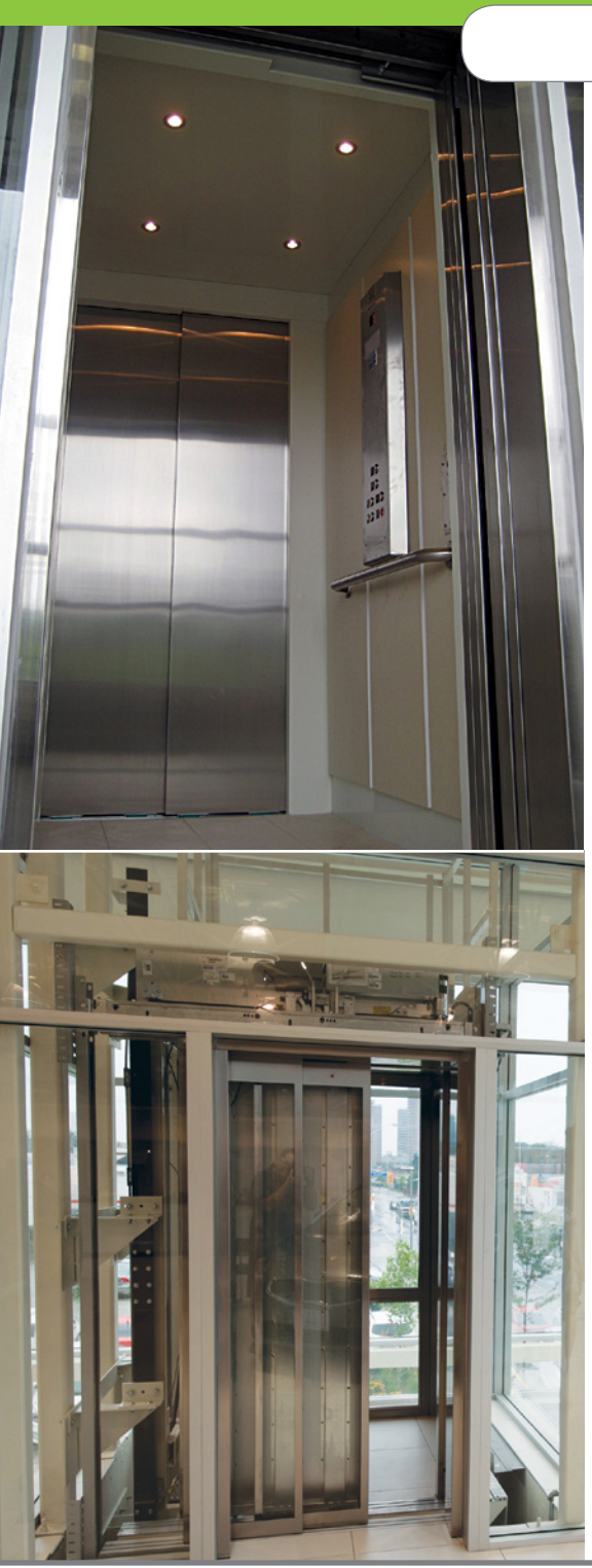
Authorized Savaria dealer: