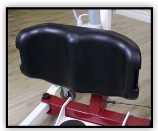
Contoured knee pad with 3 height settings