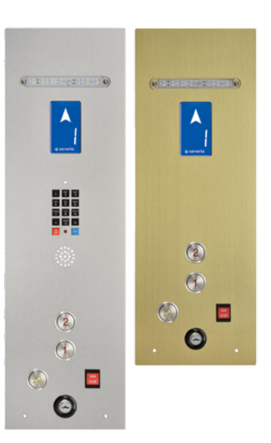
Cab operating panels (COP) with and without phone

Your options include finished hardwood or unfinished veneer cabs in traditional species including oak, cherry and maple. We also offer scratch and fade-resistant luxury MDF panels in a variety of colors and finishes. Our standard elevator includes your choice of melamine or unfinished MDF, and white ceiling with 4 LED pot lights.