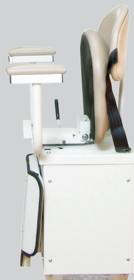
Folds to 14"