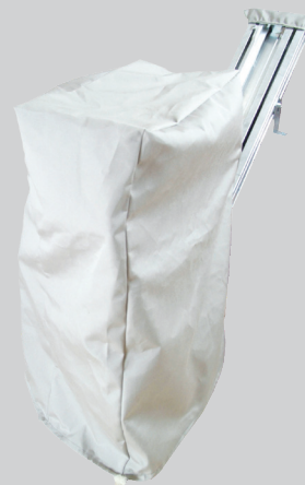
Large Weatherproof Cover included.